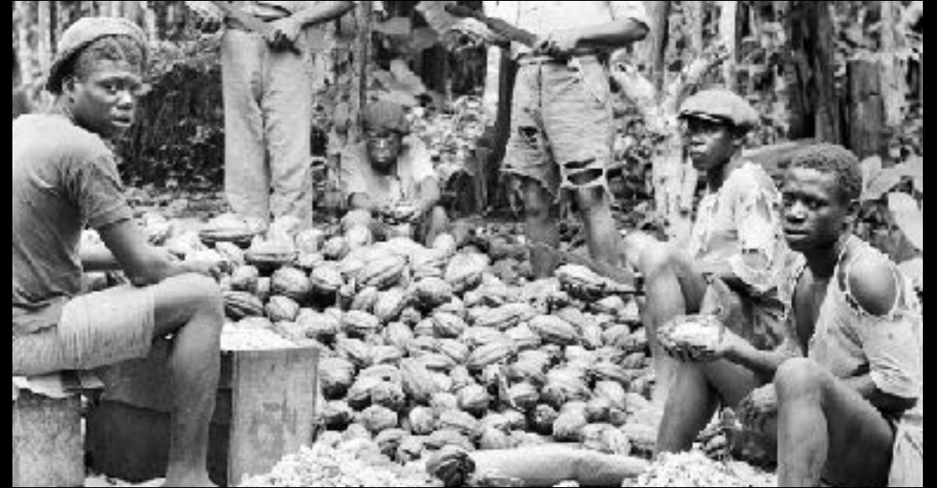
FREED FROM SLAVERY

...to help us remember & understand redemption