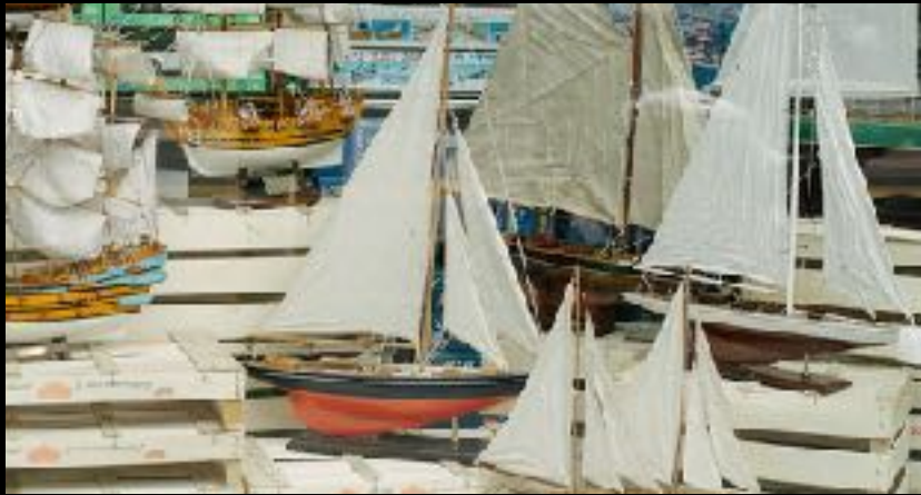
THE MODEL BOAT